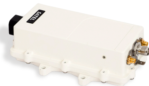
SATEL MCCU-20 LTE / UHF